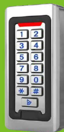
S602 Metal Keypad