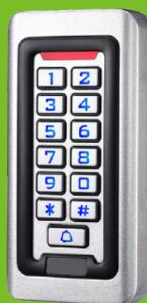
S602 Silicon Keypad